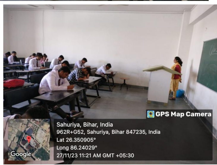
Participated during Quiz competition