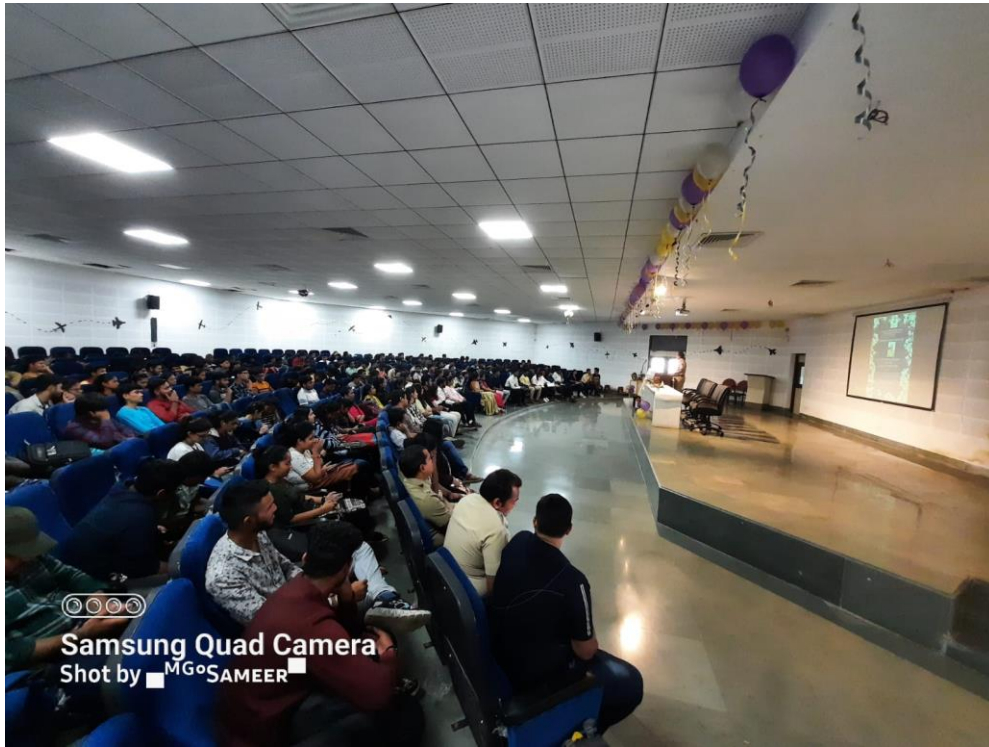
Participants during the session