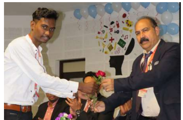
Felicitation of Guests