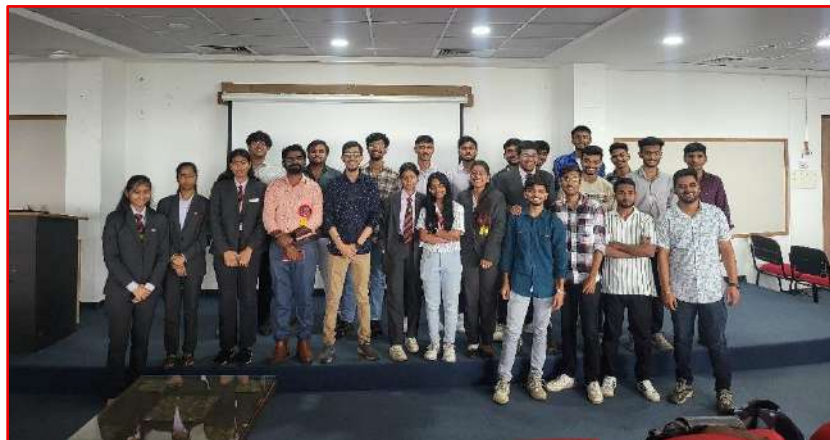
Photograph 2: Event Participants Photograph – 2