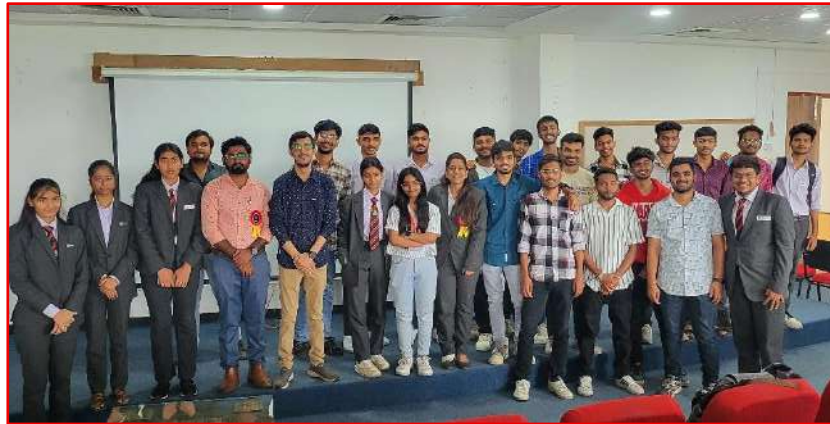
Photograph 1: Event Participants Photograph - 1

https://drive.google.com/drive/folders/1LavzJj9_YaPECcRLP8ZdkyOYEhjMTgre