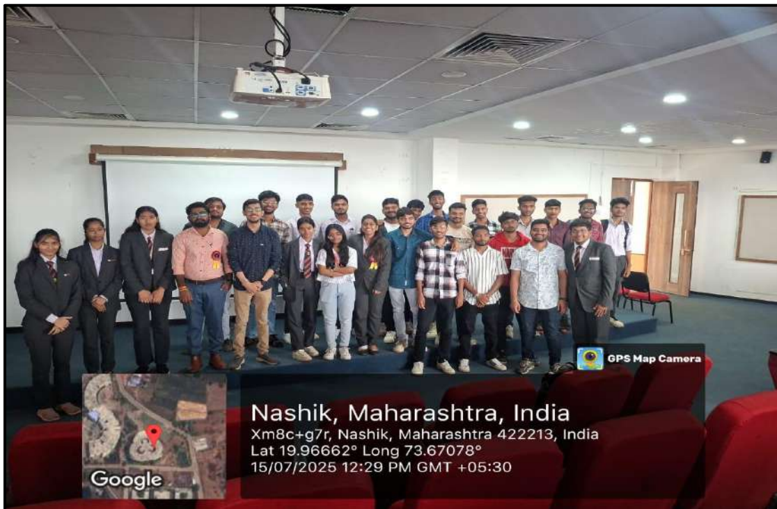
Photograph 4: Post-Event Photograph