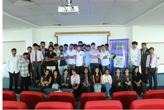
ii. Participants Photograph (2)