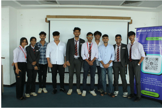
i. Participants Photograph (1)