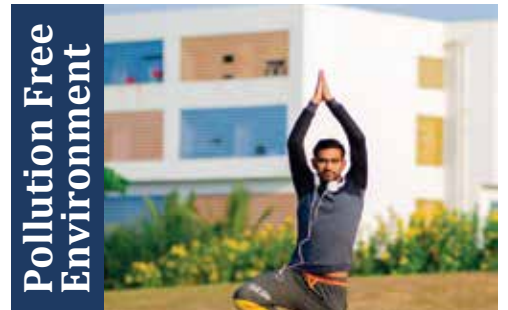
Pollution Free Environment