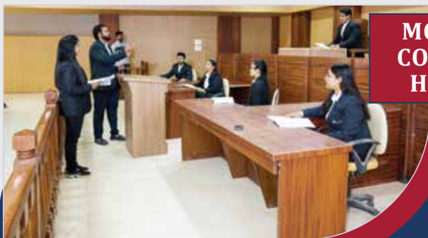
MOOT COURT HALL

The School of Law has a computer lab with internet facilities to enable students to enrich their knowledge with modern technology and access to online legal databases such as Manupatra and we stlaw for legal research.