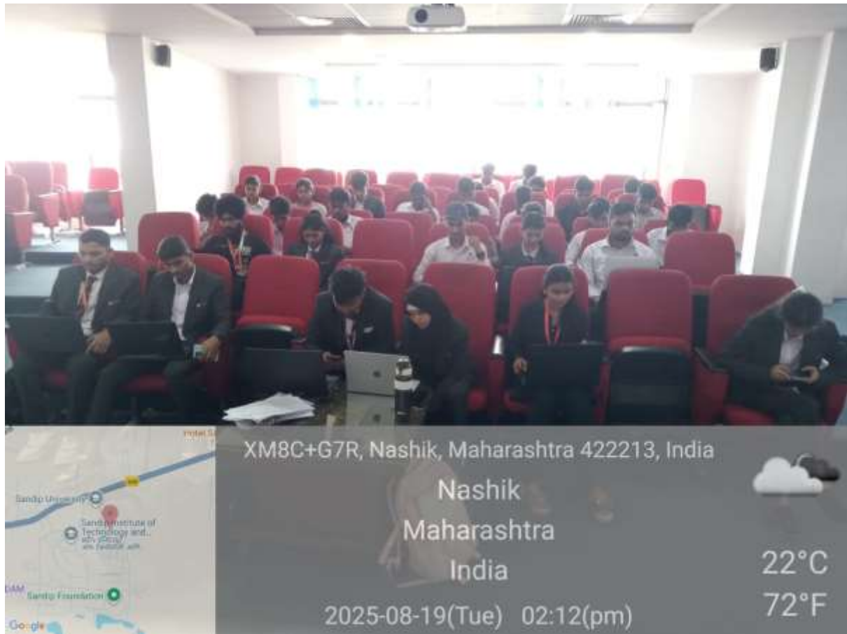
Glimpses of workshop activity