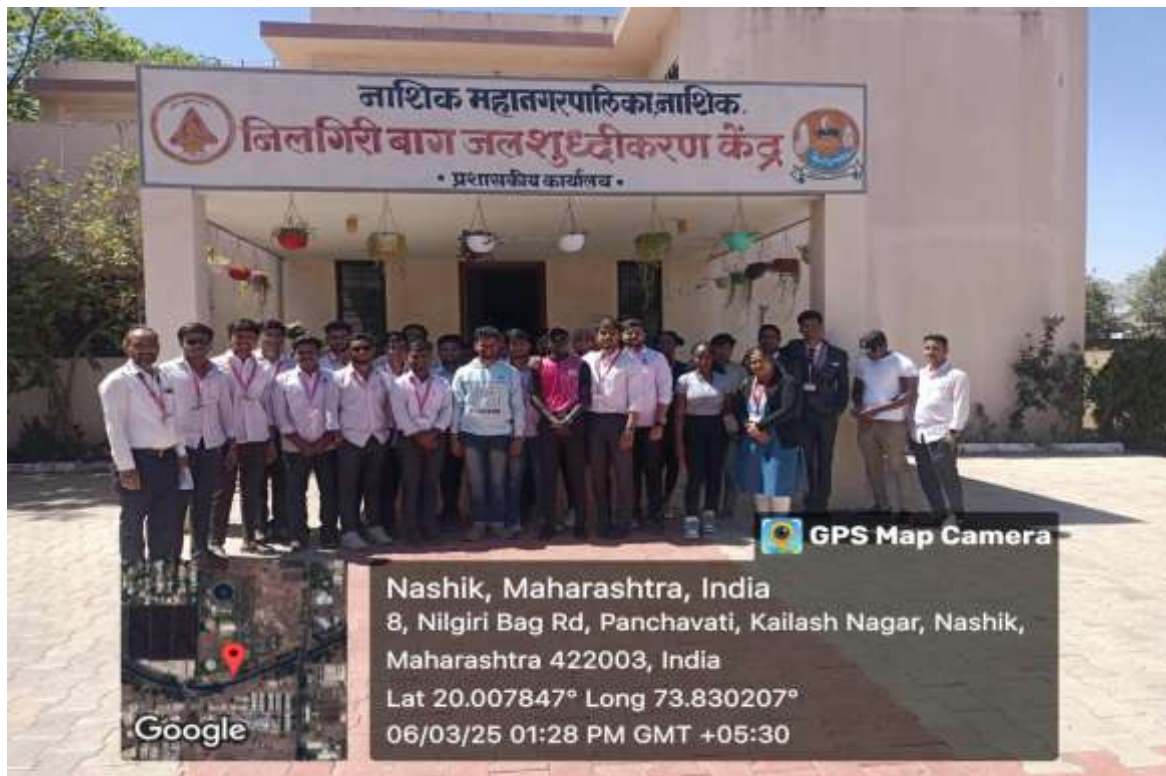
Students and faculty at Water Treatment Plant