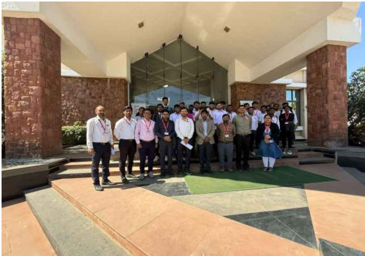
Students and faculty departing for Water Treatment Plant