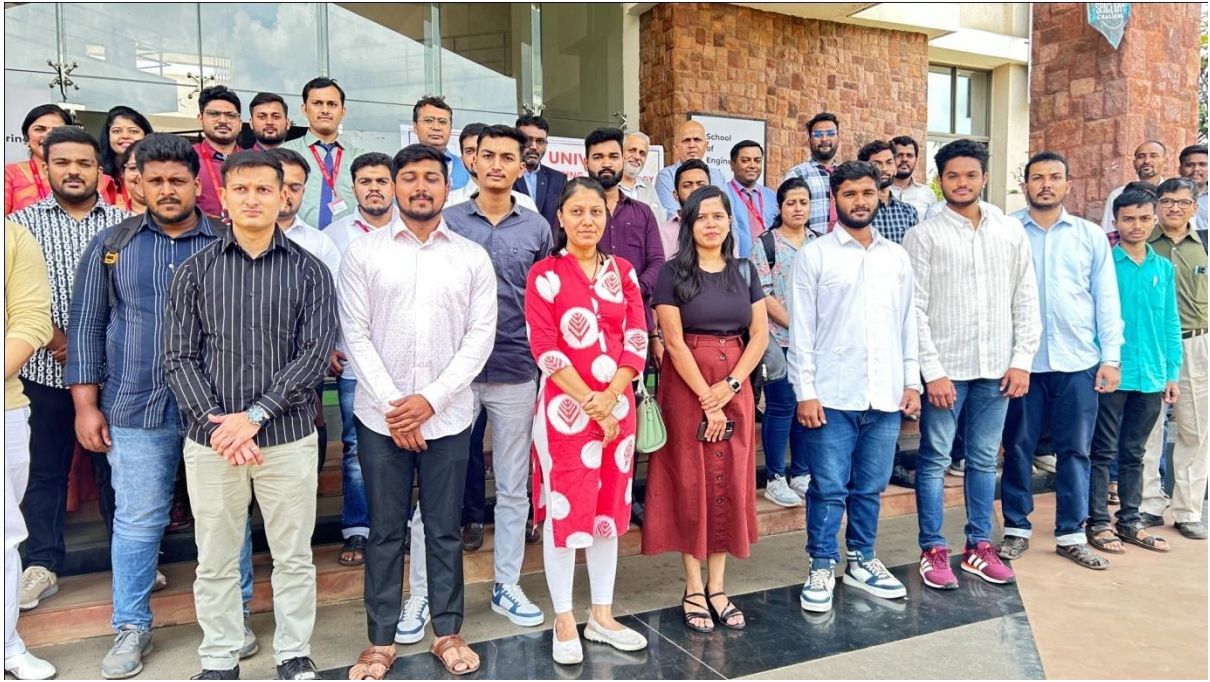
The students and staff get together at the entry gate of SoEt ,Y Buiding,SUN.