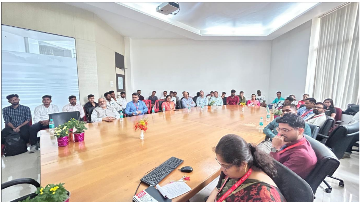
Staff and Students at Deans conference room