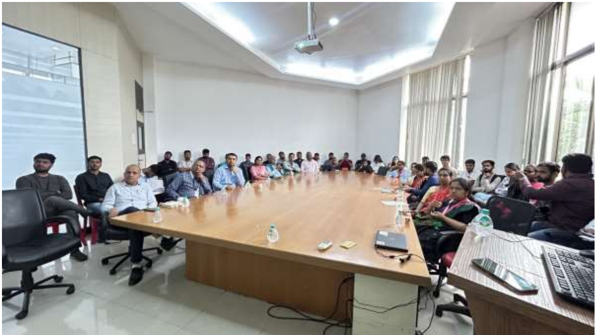
Participants present during expert lecture