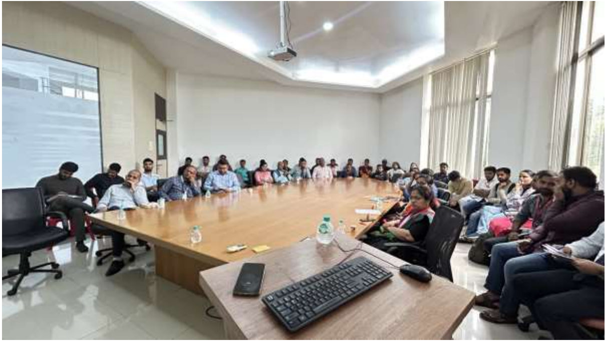
Participants presents during the lectures