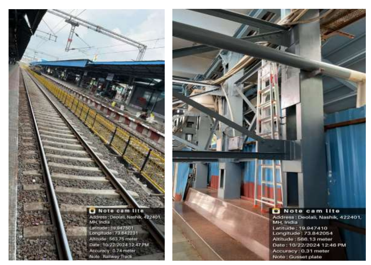
Railway Track separator