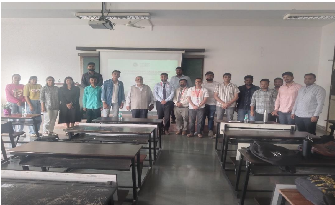
Group Photo of Session 2