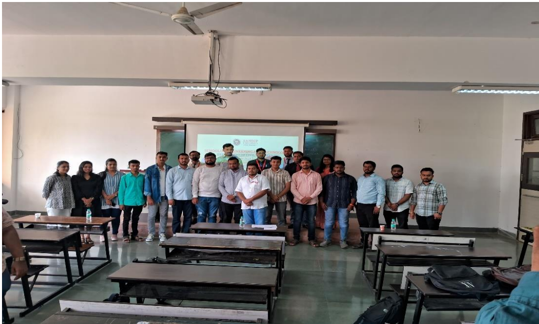
Group photo of Session 1