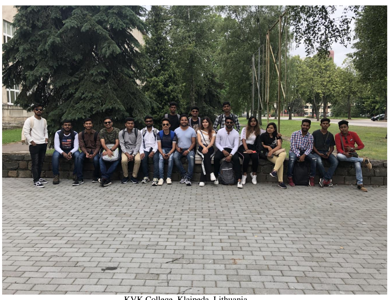
KVK College, Klaipeda, Lithuania