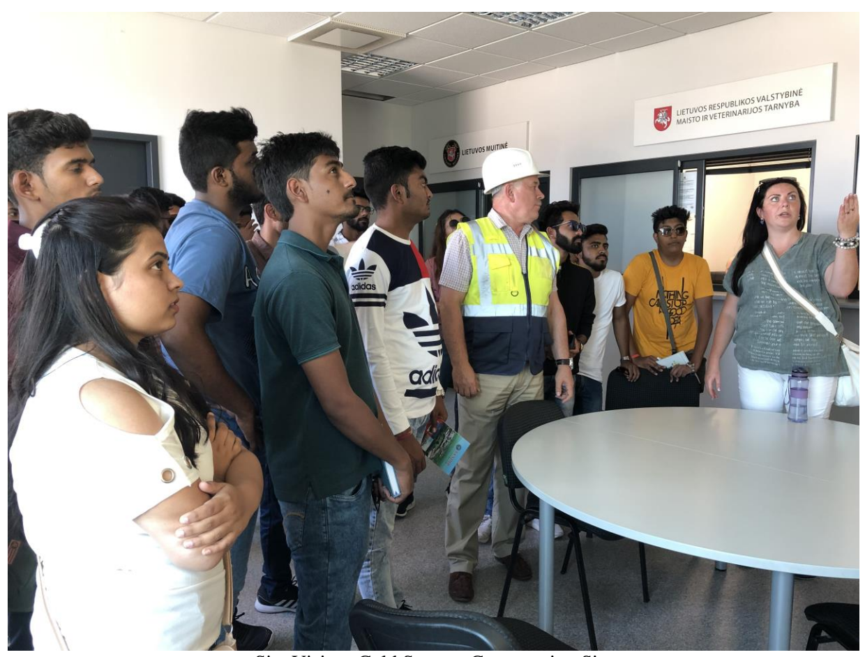
Site Visit to Cold Storage Construction Site