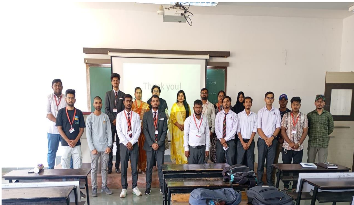
Group photo with faculty and students and expert