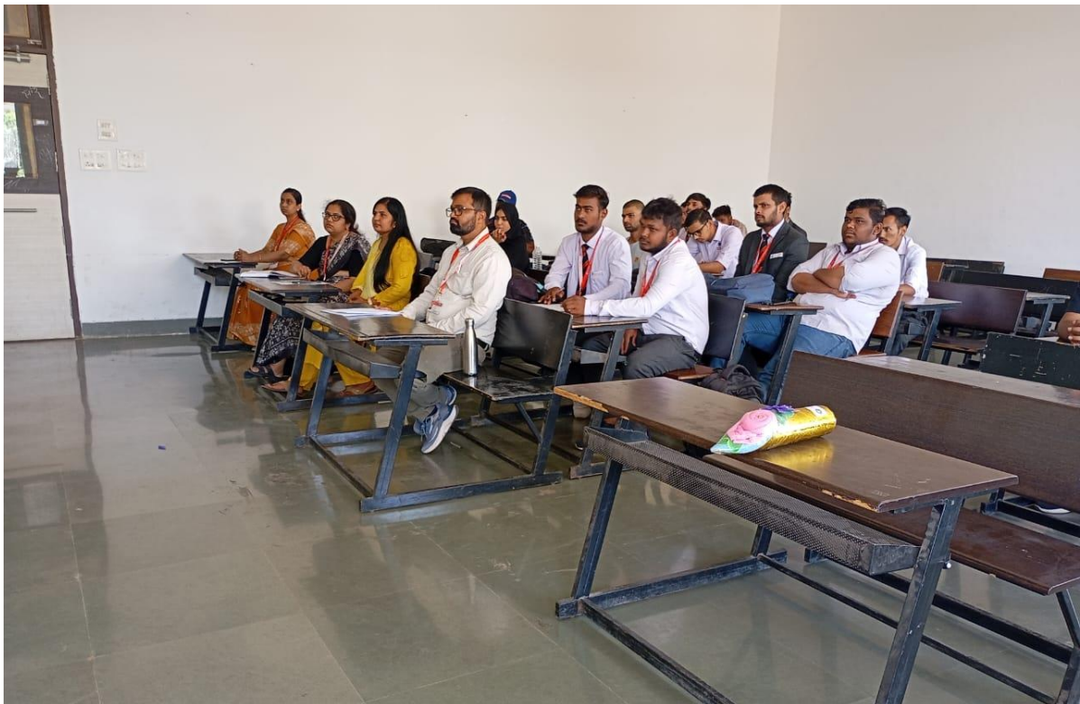
Faculty and students attending expert lecture