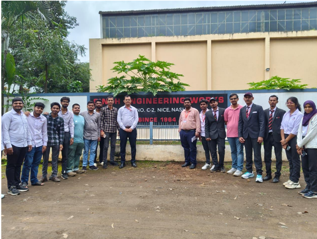
Group Photo with Faculty and Students at Singh Engineering Works PVT Ltd., Satpur, Nashik.