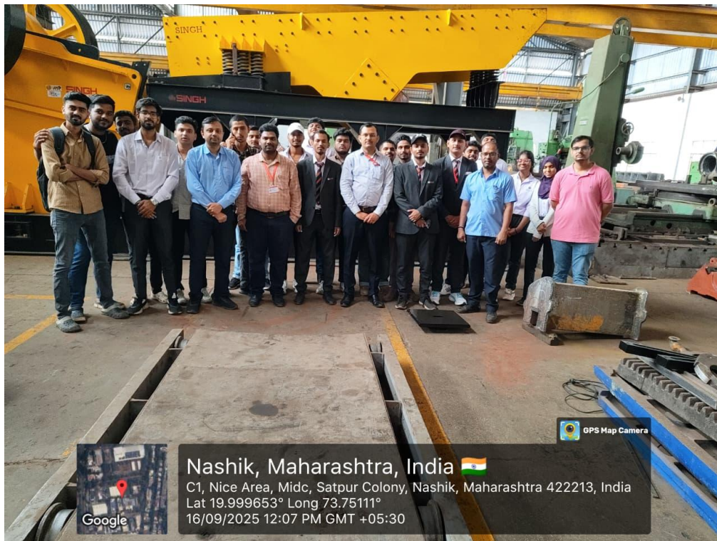
Bolted connections in aggregate crusher units