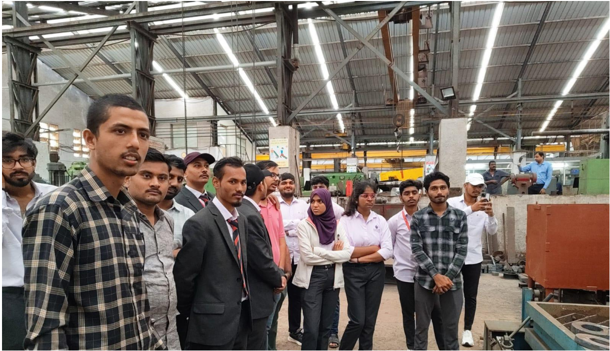
Students Observing the Steel Fabrication and Machining Process