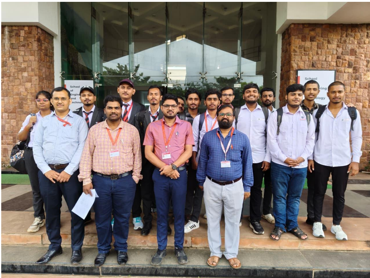
Group photo at the Entrance of Y-Building: Faculty members and students