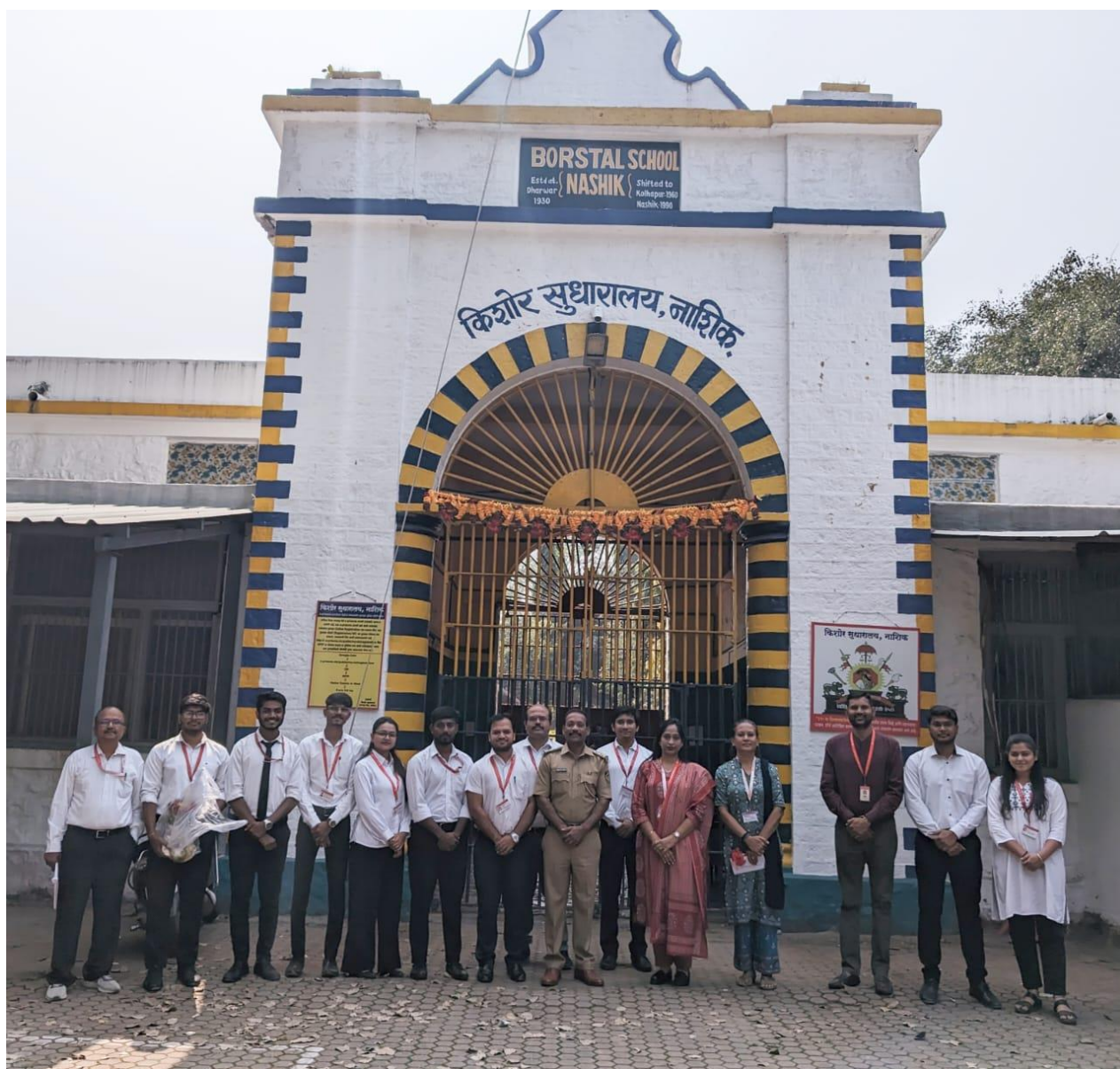
Students and Faculties at the entrance