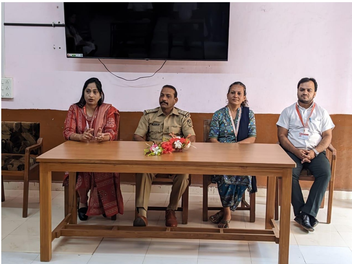
Faculties interacting with the detainees of the Borstal School