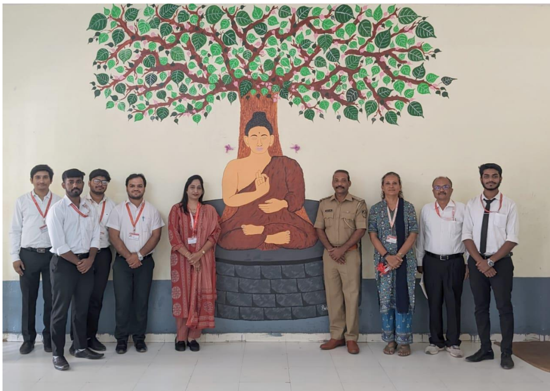
Students Inside the Borstal School