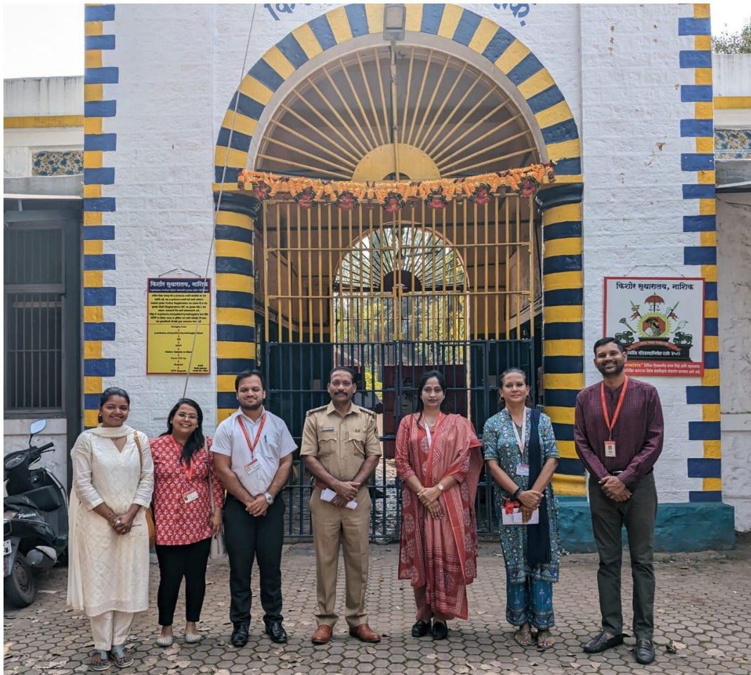
Faculties at the entrance