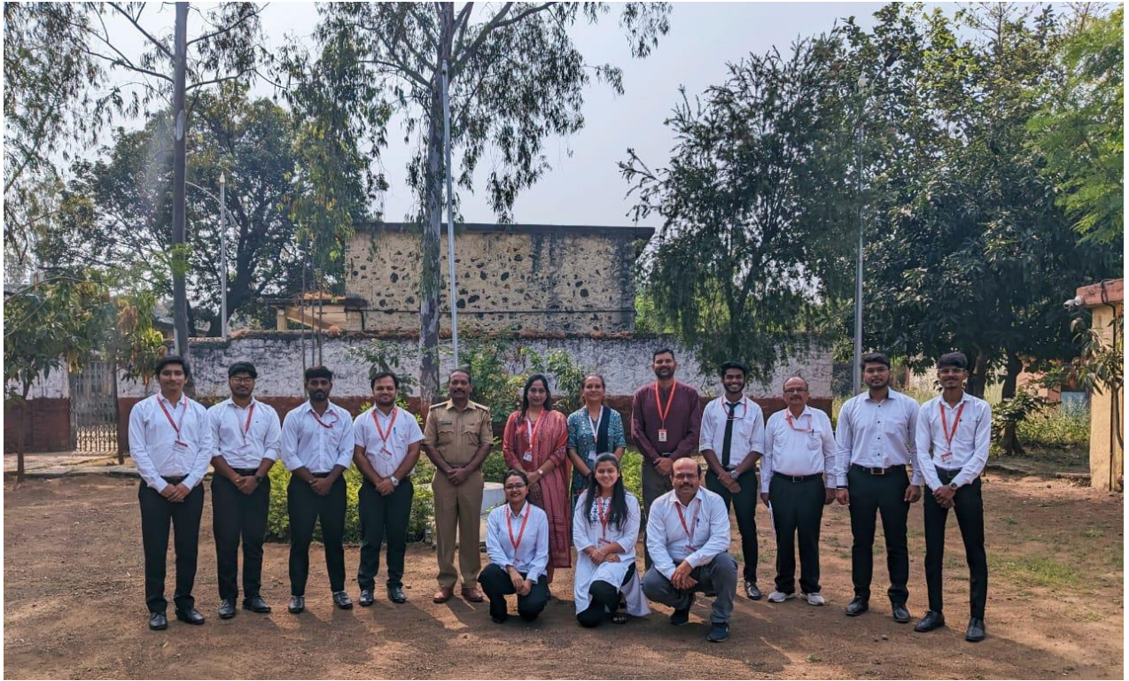
Students and Faculties inside the Borstal School