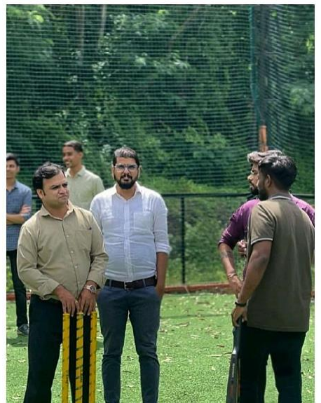
E-Learning resources , Guest lecture ,Campus Visit and Senior junior meet , Examination rules and senior junior meet with Box cricket