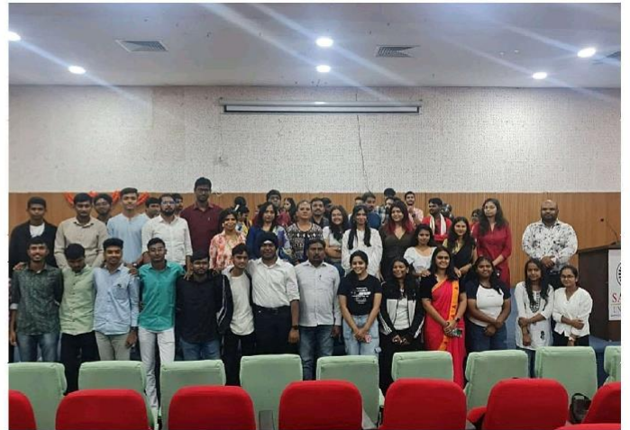
Independence Day Celebration and Cultural Program