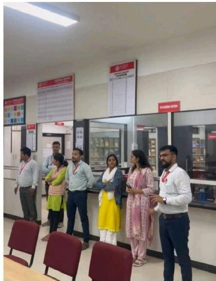
Welcome to the Students and introduction to School ERP,FAS, training and Placement Counseling Library tour and rules