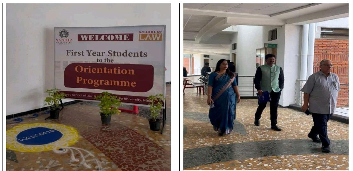
Program at seminar hall S building