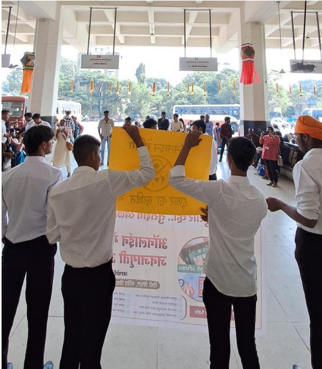
Glimse from the Event