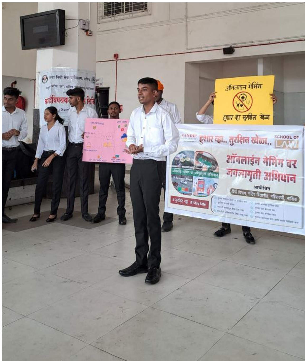
Student giving social message