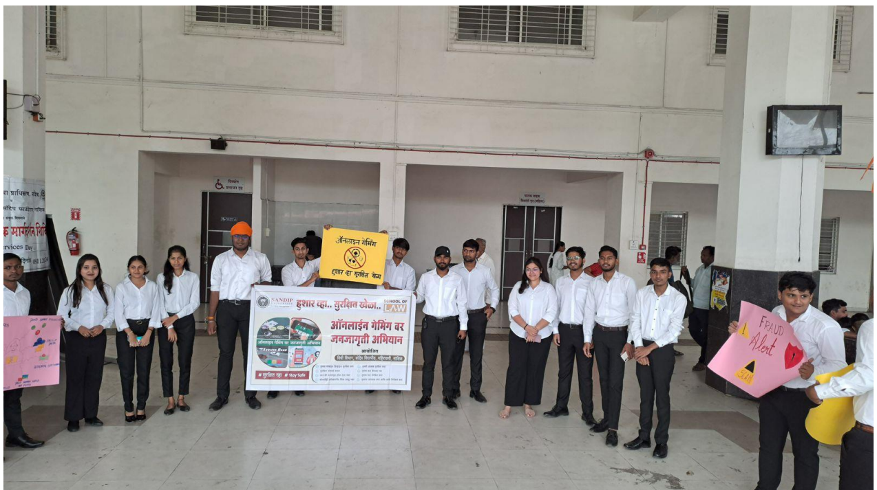
Students performing at Mela Bus Stand