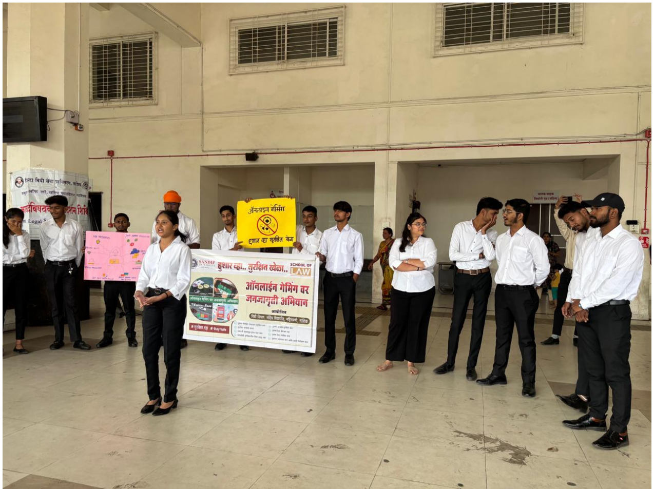
Students performing Street Play