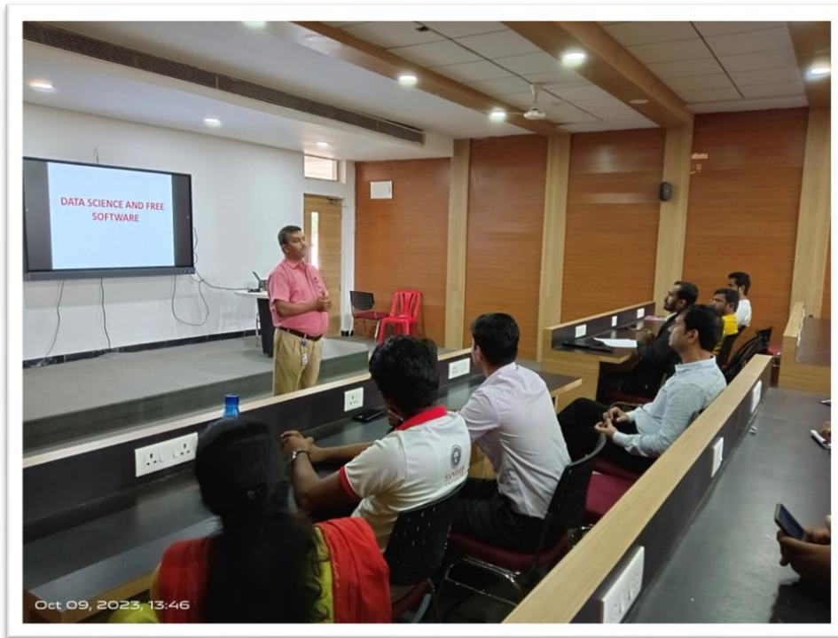
Faculty and Students attending the MDP