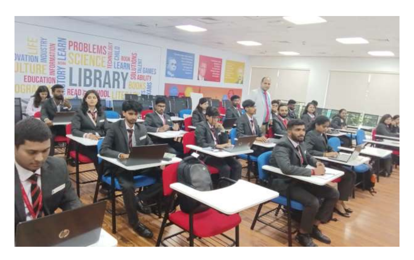
Fintech Session -