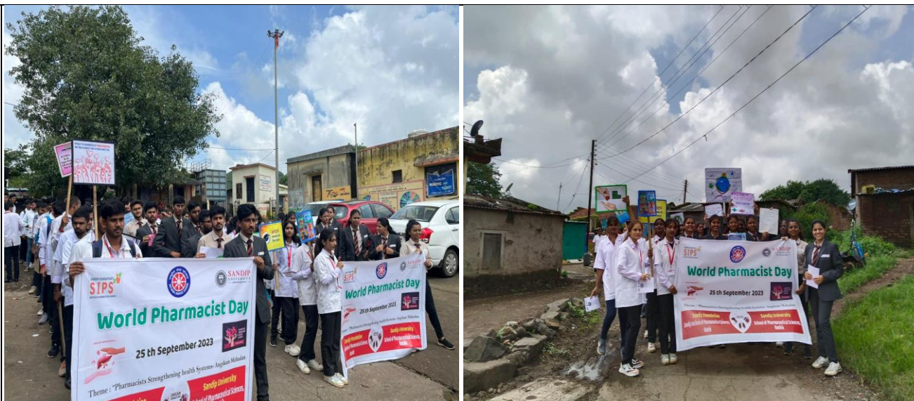
Students of SOPS and SIPS participated in Rally