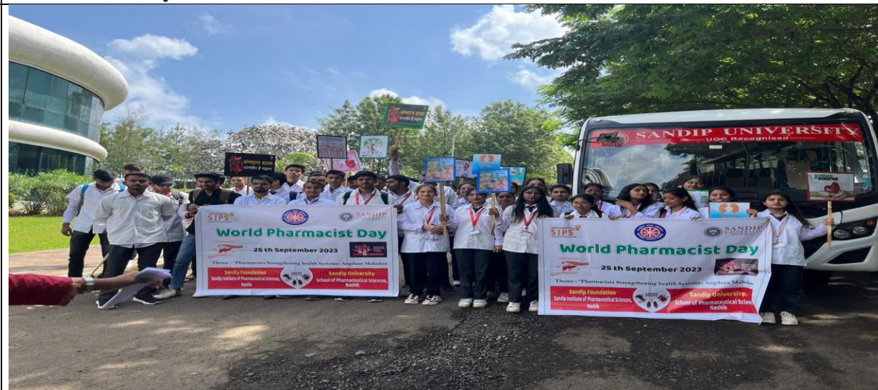
Students and Staff of School of Pharmaceutical Sciences, Sandip University, Nashik