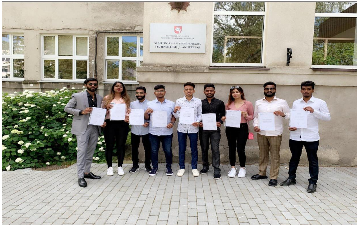
Student with certificates from Riga Building College