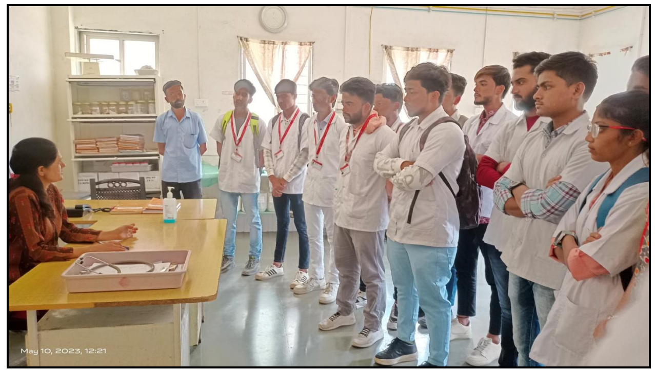
Officer explaining oncology department working