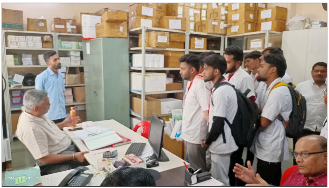
Officer explaining medicine store management