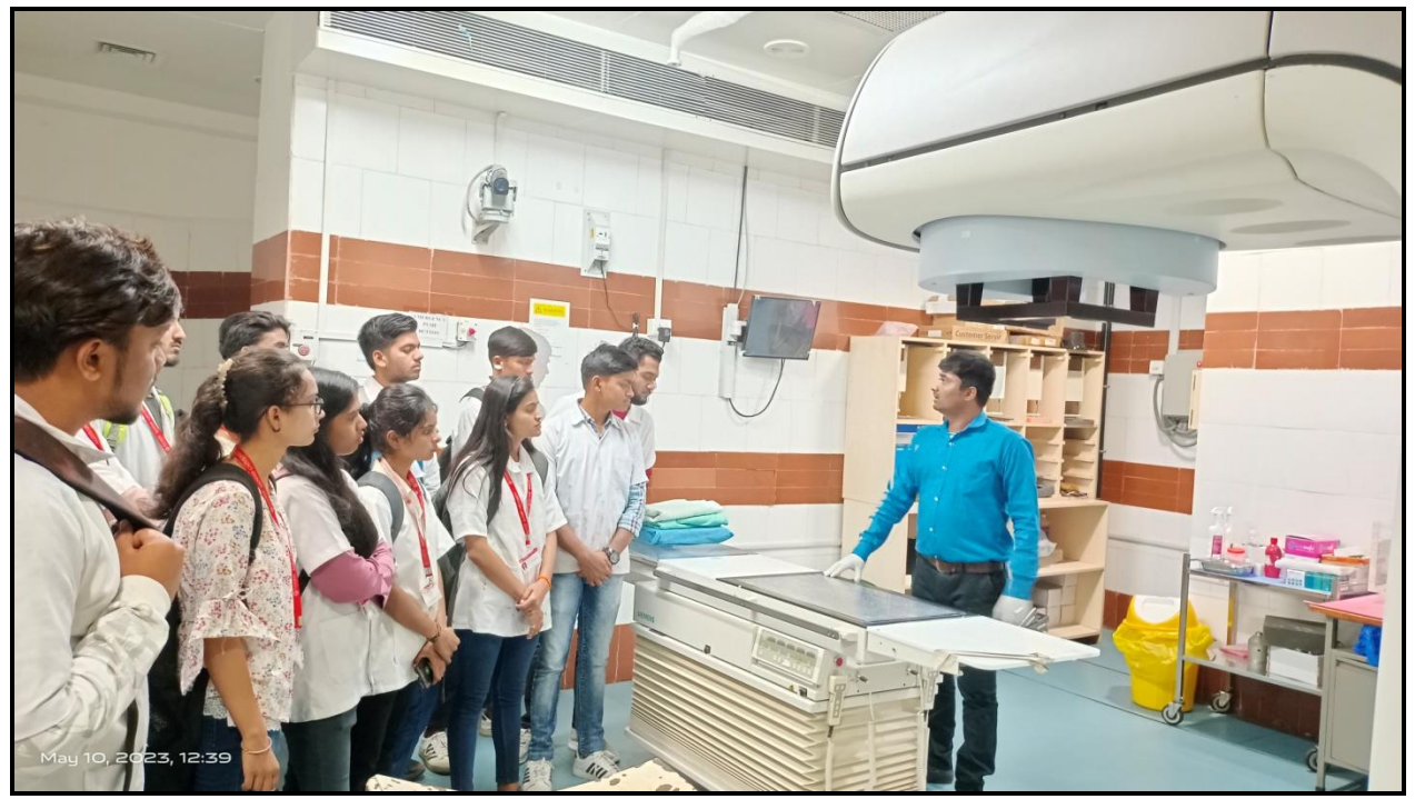
Radiologist explaining the instrument and chemotherapy basics