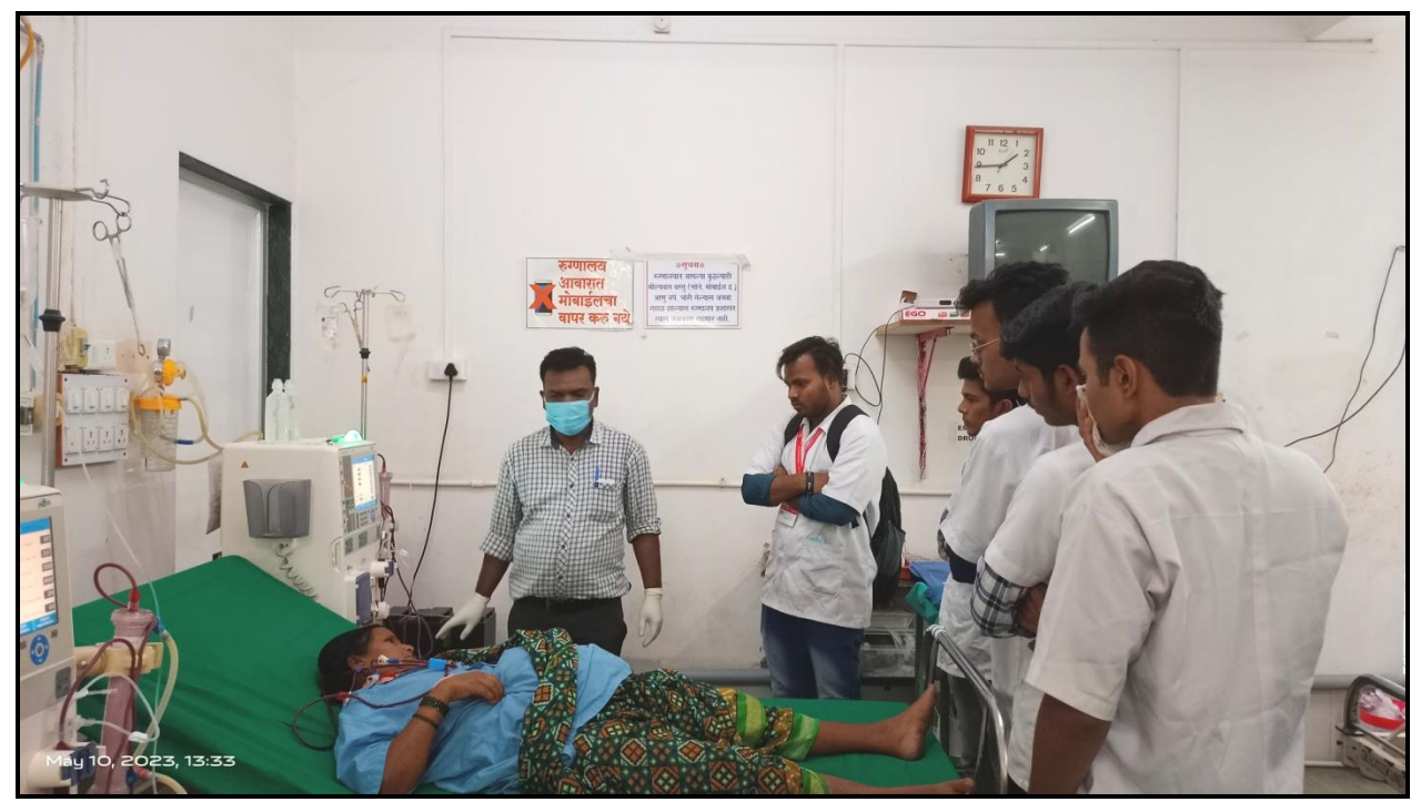
Staff explaining dialysis process to students