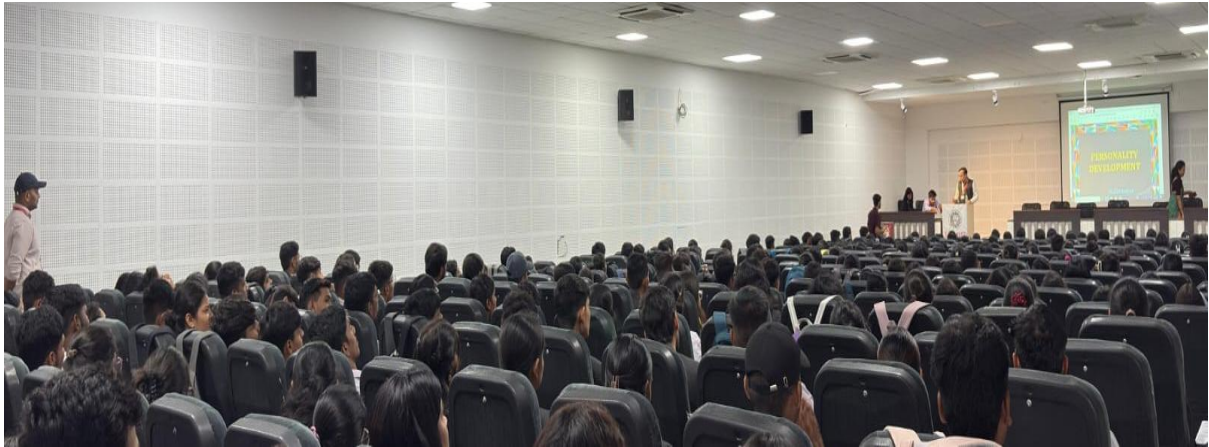
Students attending the Expert Lecture