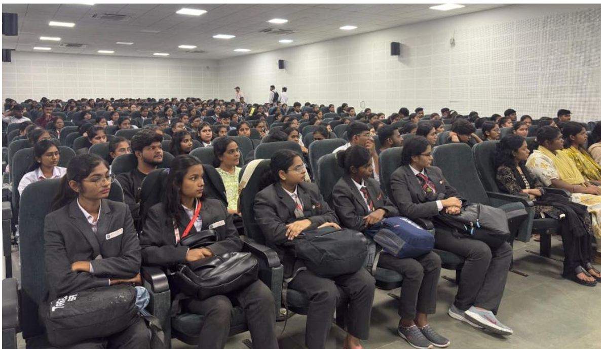
Students attending the Expert Lecture