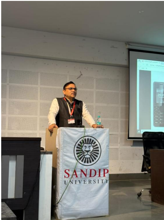
Expert delivering Lecture