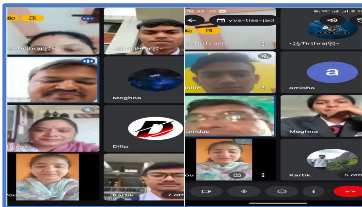
Online meeting with parents