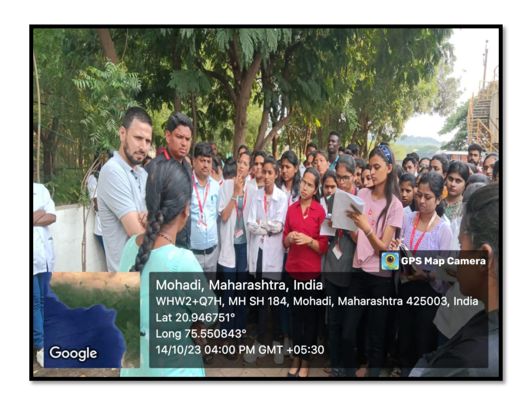
Visit at Biogas and Bio electricity generation Unit