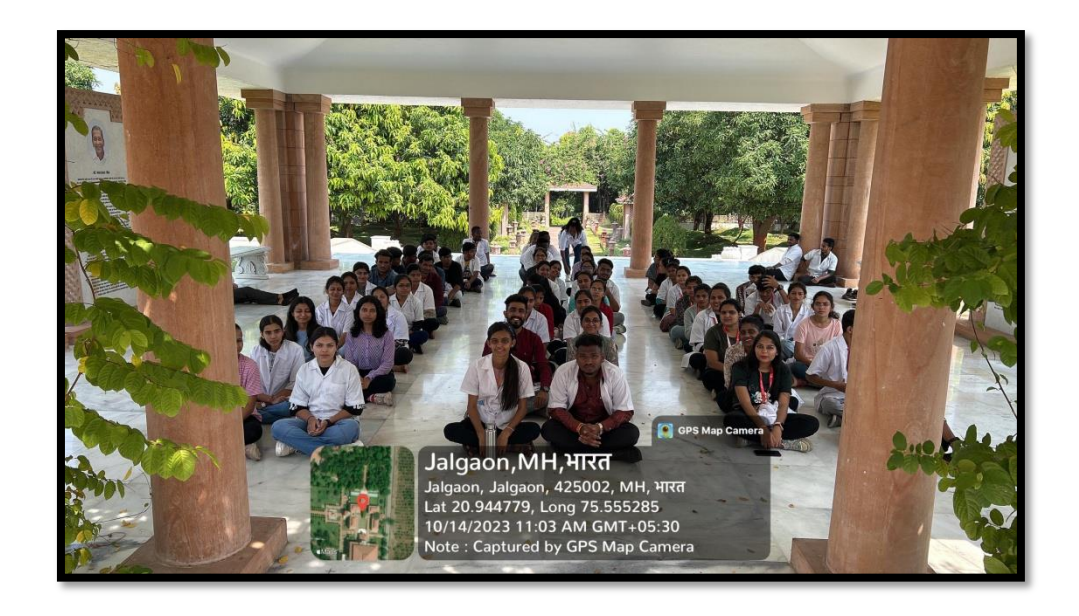
Students at Gandhi Terth, Gandhi Research Foundation, Jalgaon