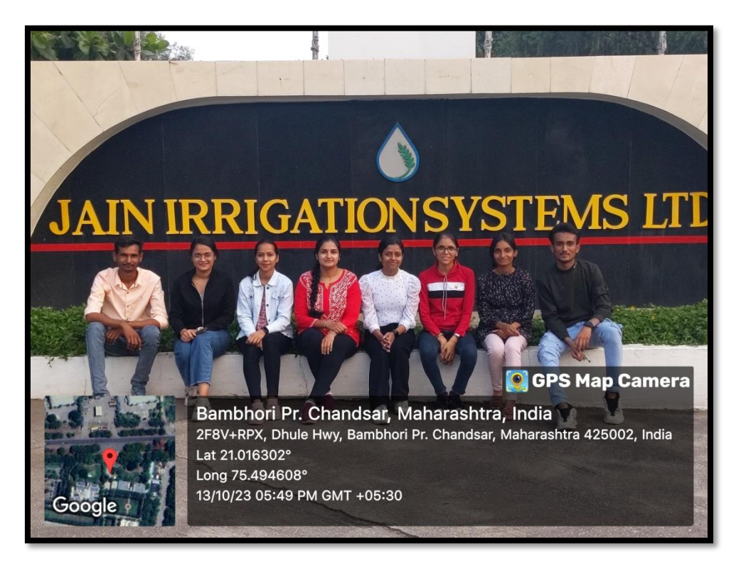
M.Sc Life Science Students at Jain Irrigation System, Jalgaon