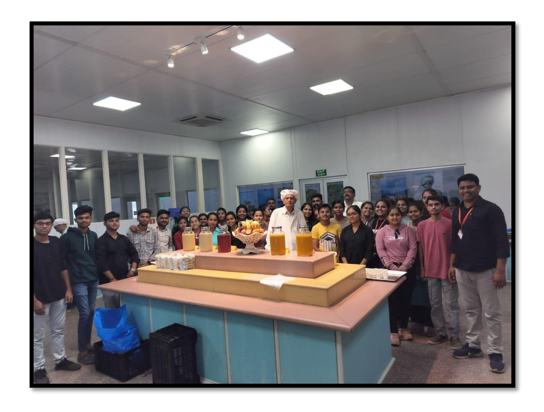
Visit at Fruit processing unit, Jain Food and Farm, Jalgoan