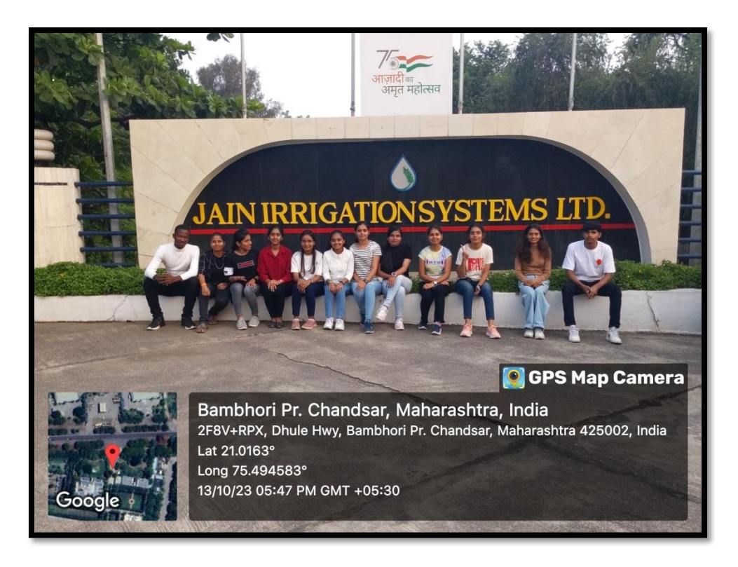
M.Sc Microbiology Students at Jain Irrigation System, Jalgaon