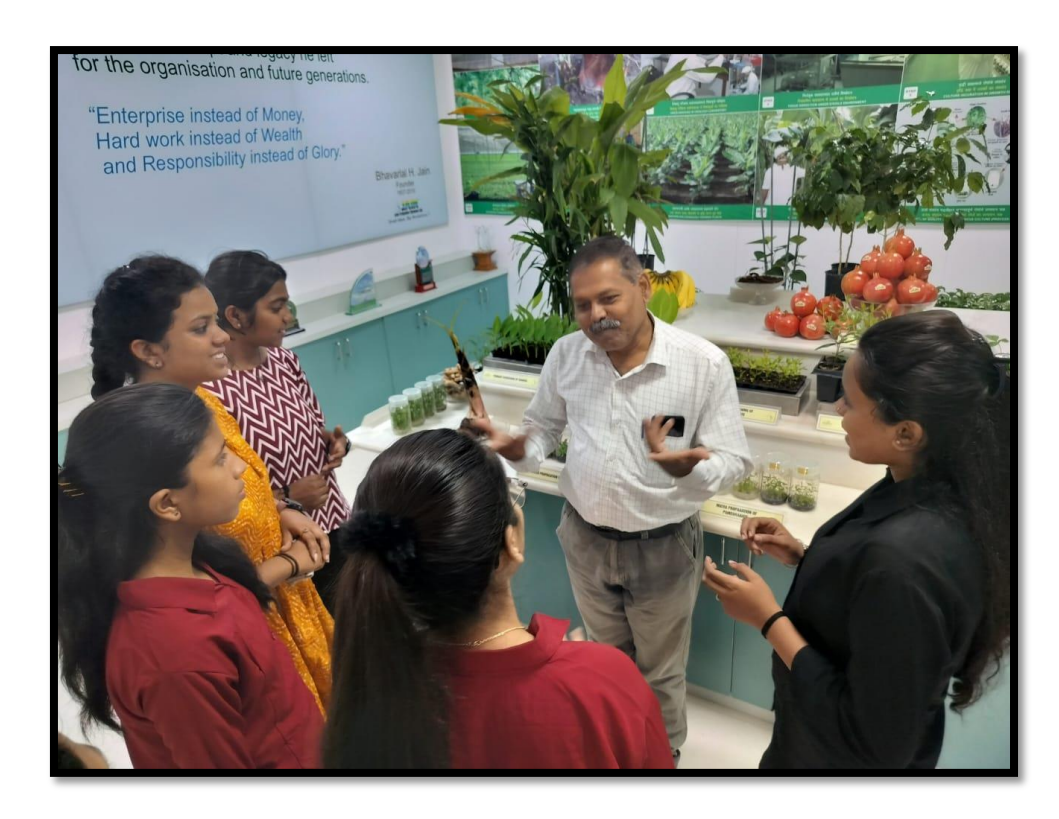
Discussion with expert at Plant Tissue Culture Lab