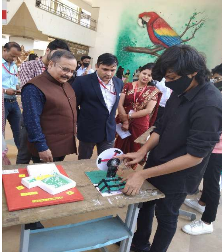
Scientific Working Model Exhibition