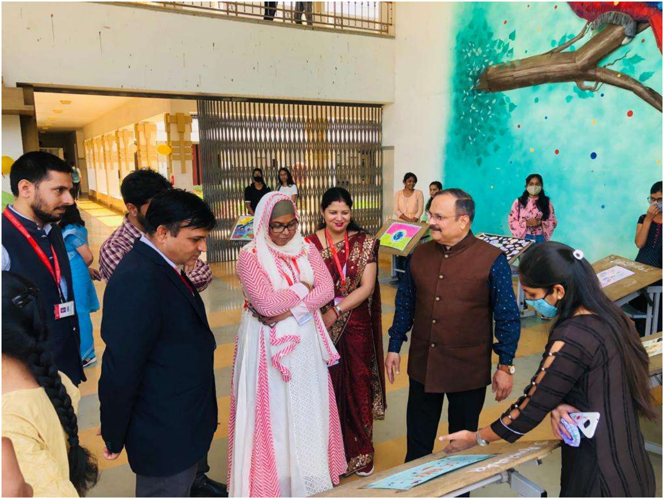
Participants Explaining Scientific Posters