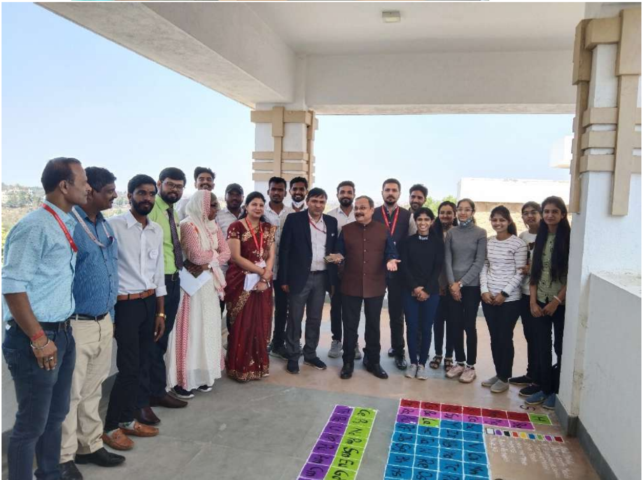
Rangoli Competition Appreciated By VC sir and Staff