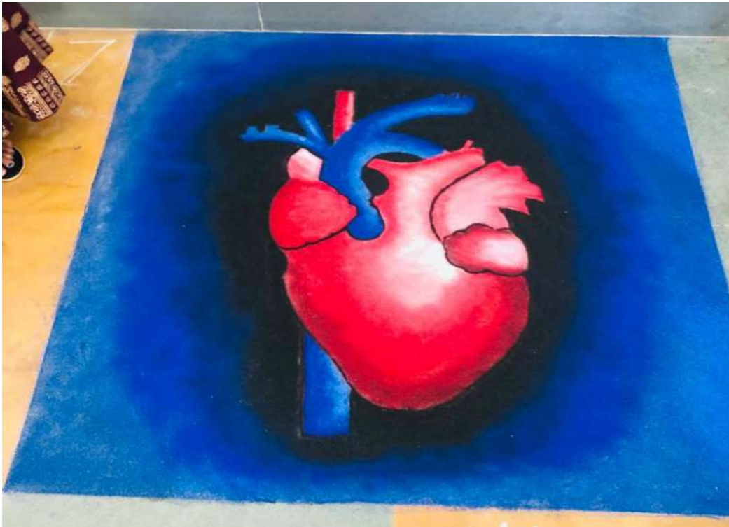
Scientific Rangoli Drawn by Participants