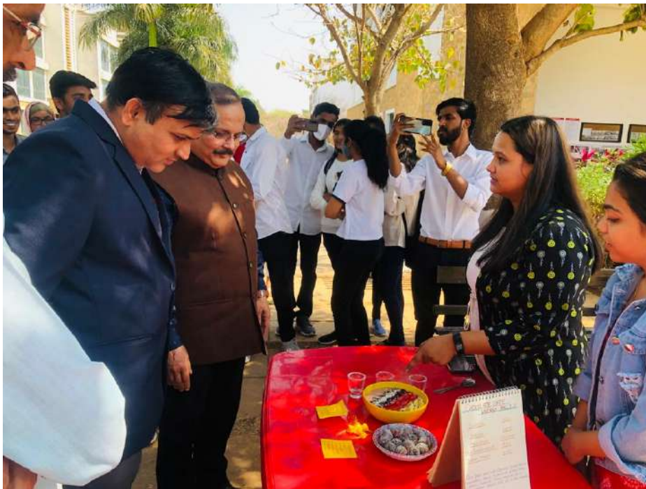
Food Junction: Participants Explaining Value of Nutrition and Health Benefits