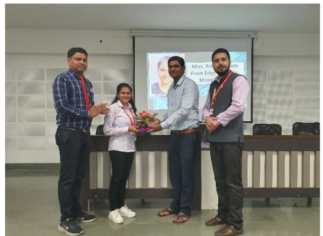
Felicitation of the toppers in the Odd Semester