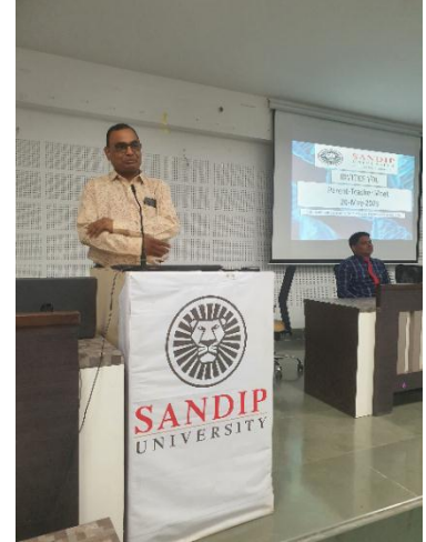
Parents interacting with the faculty and the students