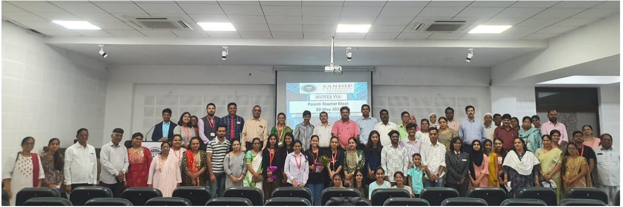
Group Photo with School of Science Faculty, Students and Parents