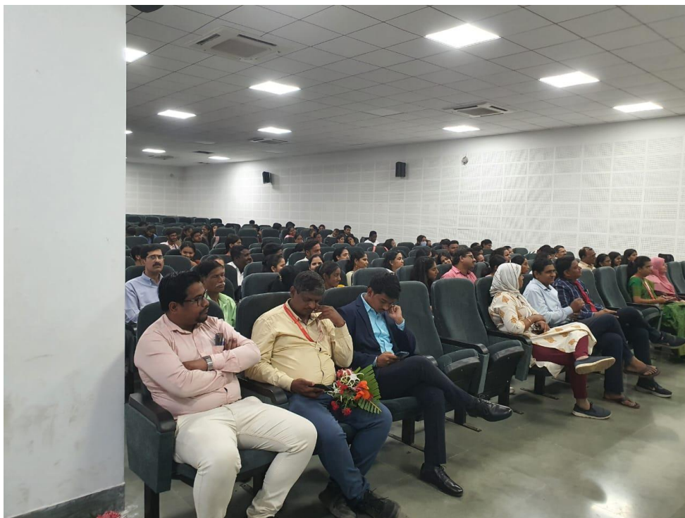
Program Audience engrossed in the interaction with the parents