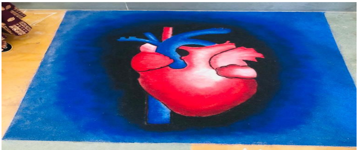
Scientific Rangoli Drawn by Participants