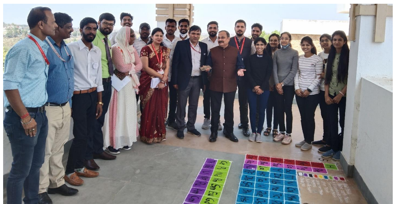
Rangoli Competition Appreciated By VC sir and Staff