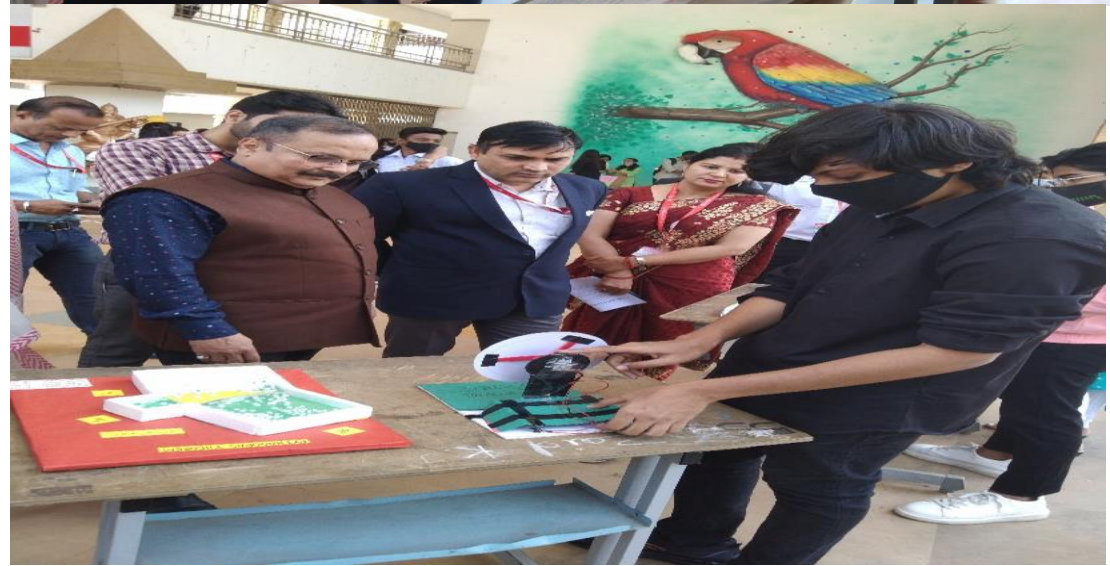
Scientific Working Model Exhibition