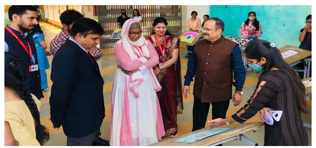
Participants Explaining Scientific Posters