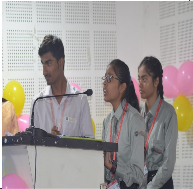
Welcome Address by Hon'ble Vice Chancellor Sir to New Admitted Students of BCA, MCA and M.TECH. VC Sir has also discussed about the Chairman as well as Sandip University and Processes of Sandip University Sijoul, Madhubani.